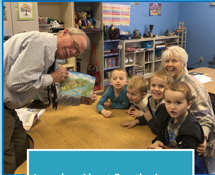
Learning About Creation!