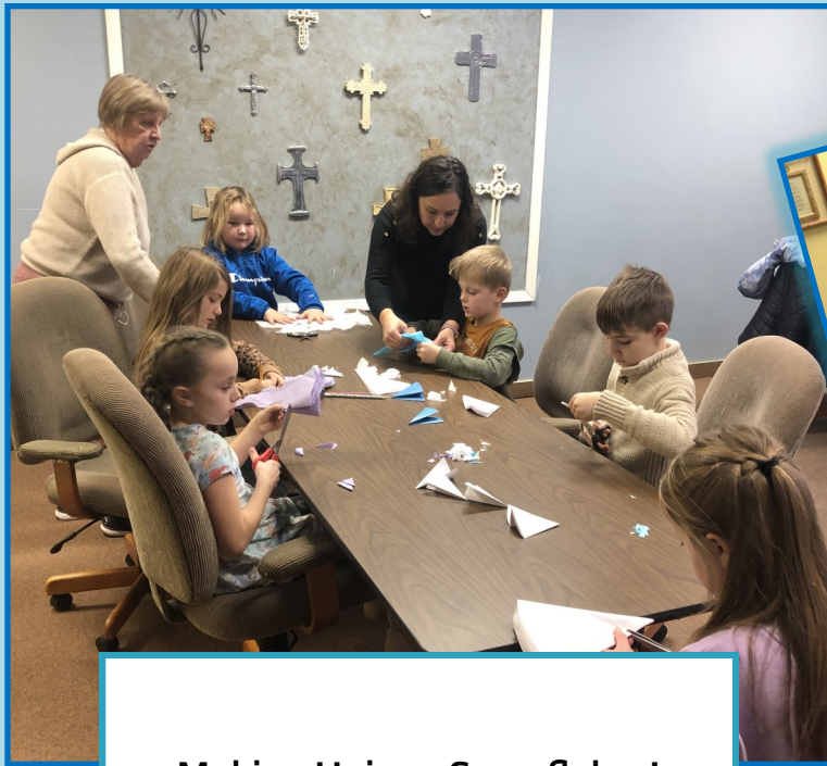
Making Unique Snowflakes!