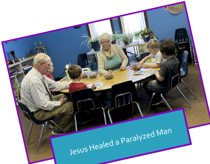
Jesus Healed a Paralyzed Man