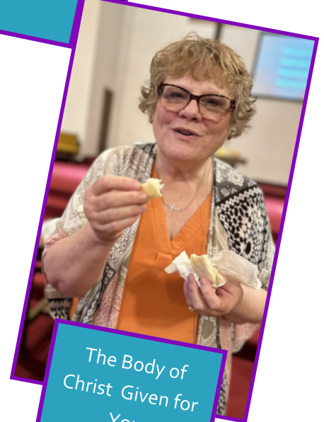
The Body of Christ Given for You