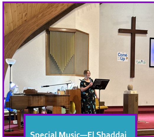
Special Music—El Shaddai