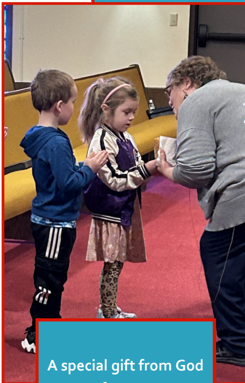
A special gift from God for you

A new security door has been installed at the east hallway entrance.