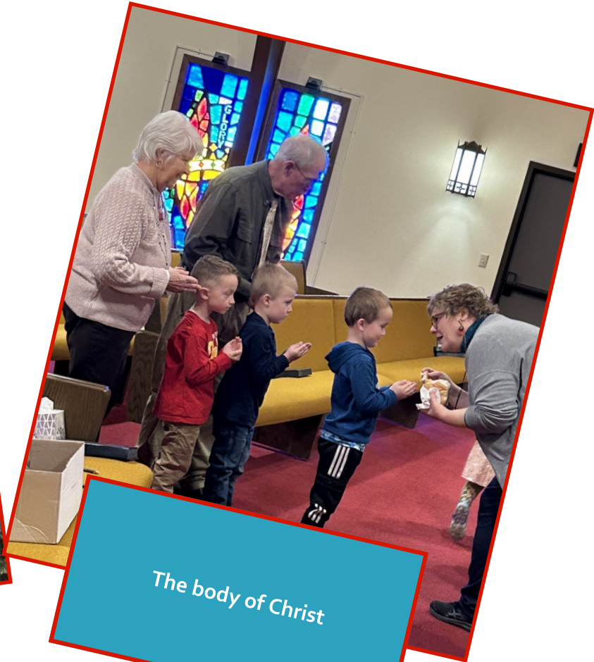
The body of Christ